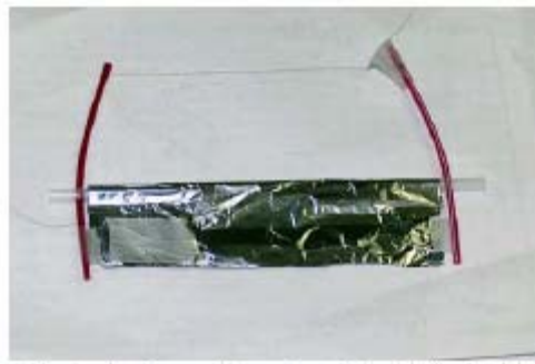
Figure 9. Flat-shaped (or wing-shaped) asymmetric capacitor used to test whether closed electrode geometry is needed.

The thin wire electrode must be at a sufficient distance away from the foil so that arcing does not occur from the thin wire electrode to the foil at the operating voltage. In fact, in our first model, shown in Figure 7, the 3-cm gap from top of the foil to thin wire electrode was not sufficiently large, and significant arcing occurred. We have found that when arcing occurs, there is little net force on the capacitor. An essential part of the design of the capacitor is that the edges of the foil, nearest to the thin wire, must be rounded (over the supporting Balsa wood, or plastic straw, frame) to prevent arcing or corona discharge at sharp foil edges (which are closest to the thin wire). The capacitor in Figure 7 showed improved lift when rounded foil was put over the foil electrode closest to the thin wire, thereby smoothing-over the sharp foil edges. Physically, this means that the radius of curvature of the foil nearest to the small wire electrode was made larger, creating a greater asymmetry in radii of curvature of the two electrodes.