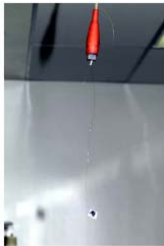
Figure 10. The capacitor consisting of a single wire. No bias applied.

When the asymmetric capacitors have an applied DC voltage, and they are producing a net force in air, they all emit a peculiar hissing sound with pitch varying with the applied voltage. This sound is similar to static on a television or radioset when it is not tuned to a good channel. We believe that this sound may be a clue to the mechanism responsible for the net force.