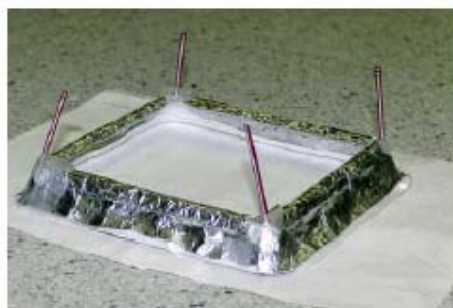
Figure 8. The second attempt at making a lighter asymmetric capacitor.

Consequently, we decided to make a second version of an asymmetric capacitor, using a Styrofoam lunch box and plastic drinking straws from the ARL cafeteria (Figure 8). The capacitor had a square geometry, 18\text{ cm} \times 20\text{ cm} . The distance of the thin wire (38 gauge) to the foil was adjustable, and we found that making a 6-cm gap resulted in little arcing. When 30 kV was applied, the capacitor drew \sim 1.5 mA, and hovered vigorously above the floor.