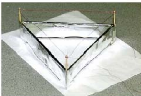
Figure 7. Our first attempt at making an asymmetric capacitor (a “lifter”), according to the specifications given by J. Naudin on Internet Web site < http://jnaudin.free.fr/ >.

When \sim 37 kV was applied to the capacitor in Figure 7, the current was \sim 1.5 mA. The capacitor lifted off its resting surface. However, this capacitor was not a vigorous flier, as reported by others on the Internet. One problem that occurred was arcing from the thin wire electrode to the foil. The thin wire electrode was too close to the foil. We have found that arcing reduces the force developed on the capacitor. Also, compared to other constructions, ours was too heavy, 5 g. We found that a ground plane beneath the capacitor is not essential for the lifting force to exceed the capacitor's weight.